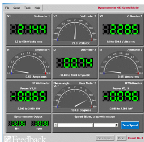
Virtual Instrumentation with a mix of analogue and digital readout